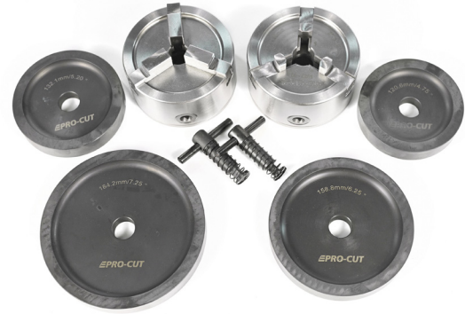
50-4250K Quick Chuck Kit