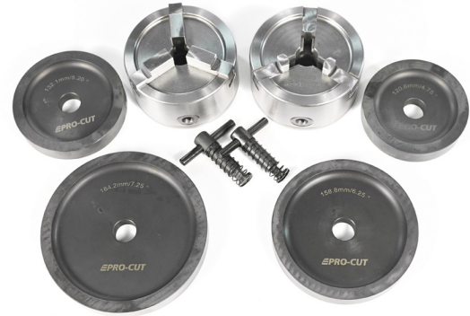
50-4250K Quick Chuck Kit